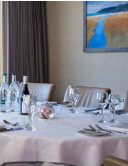
Above - Atlantic Room