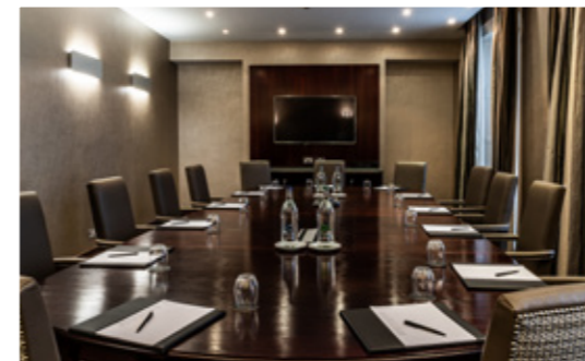
Top - Crystal Room