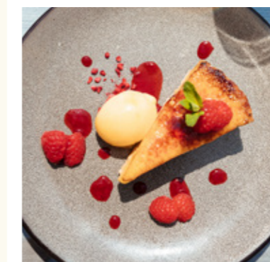
Top right - The Drawing Room

The elegant Drawing Room is ideal for formal or relaxed get-togethers, seating up to 24 for a private luncheon or dinner party.